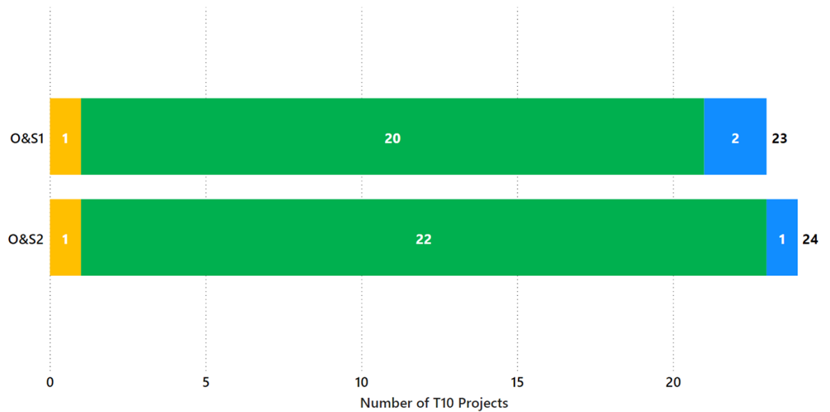
Figure 2 – Projects by Status

Project Status ● Caution ● On track ● Project completed